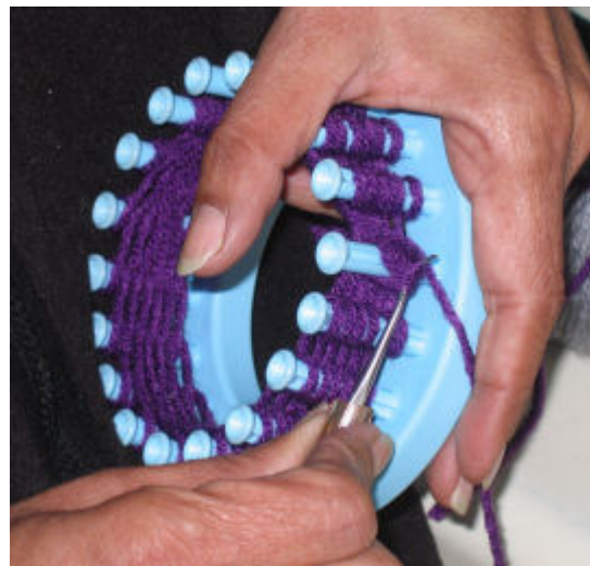
Purl one peg